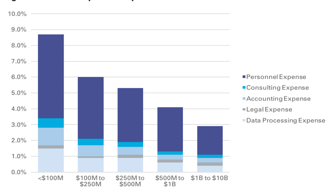
Figure 1: Mean compliance expenses at financial institutions